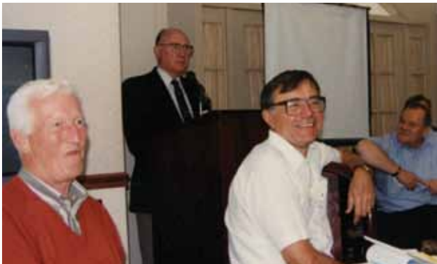
Rotarians we met at 1993 Melbourne Australia Convention came to visit our club.