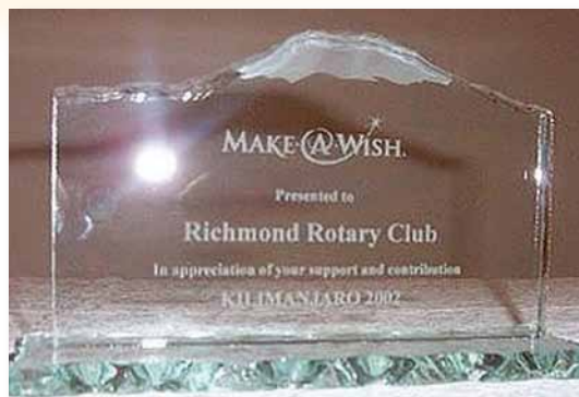
Award to the Rotary Club of Richmond as sponsor of Kilimanjaro 2002 Climb

On December 5th, 2002, the Make-A-Wish Foundation held a function at the Rosedale on Robson hotel in Vancouver to thank the sponsors who made the Kilimanjaro 2002 climb a success. Our Club was one of the recipients of these awards.