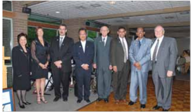
2006 Board of Directors