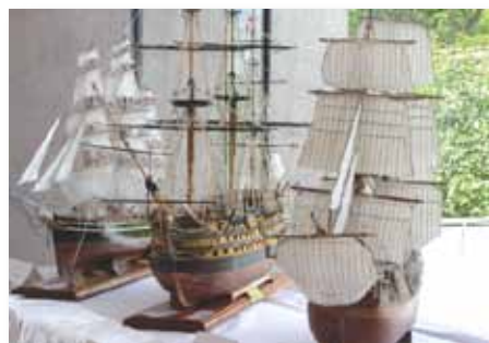
Model ship display in City Hall