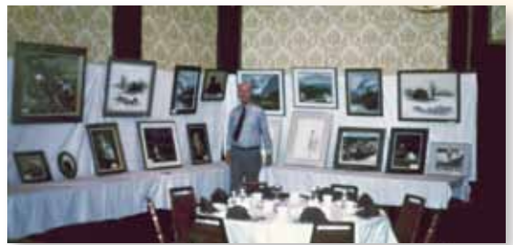
Art Auction in Richmond Inn

Funds raised from this Christmas Project were designated to the Hospital's Palliative Care Unit and Rotary Hospice House in Richmond.