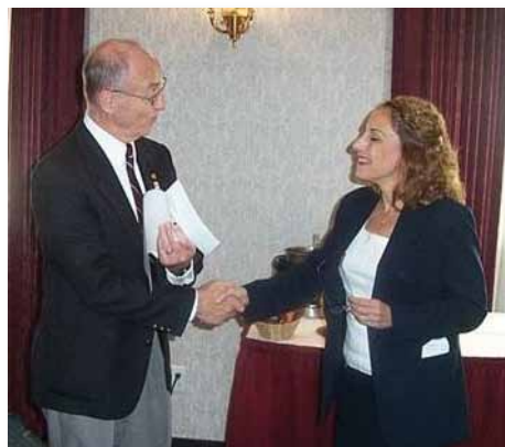
Presentation of cheque to Richmond Public Library

The new library offers a wide range of learning and recreational opportunities for children, teens and adults. With a focus on early childhood literacy and lifelong learning, Cambie Library provides books and services that change and enrich lives, especially those of children.