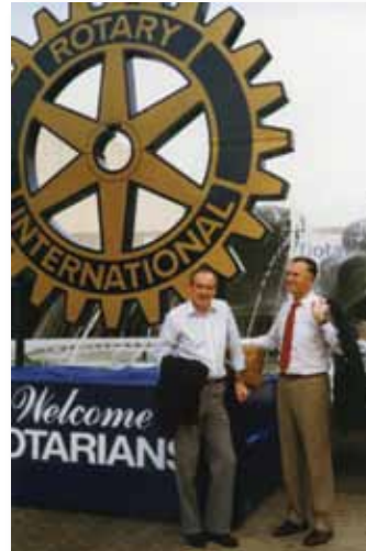
1987 Munich, Germany