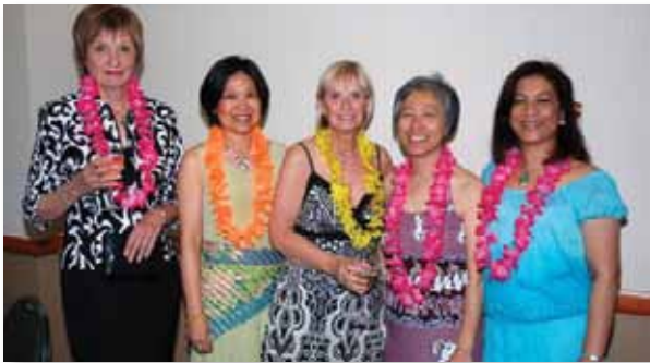
2008 Hawaiian Theme President's Ball