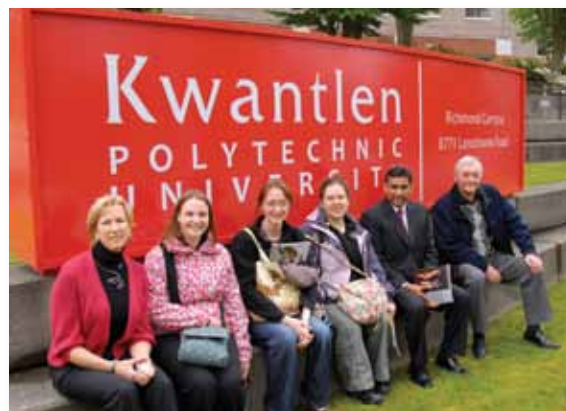
2009 GSE visited Kwantlen