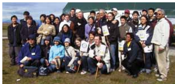
2003 Gathering for the walk