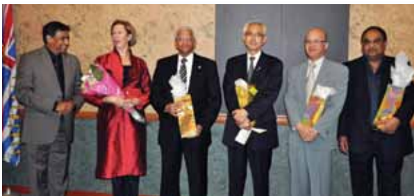
2010 Thank you gift for Board of Directors