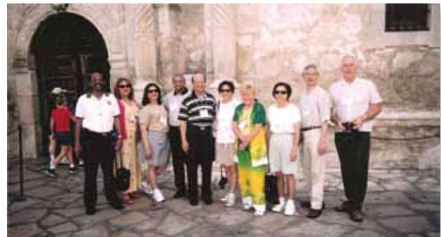
2001 San Antonio, Texas

Highlights were the opening Plenary session featuring Mikhail Gorbachev, the march of flags and the Closing Plenary session with the new International President Bhichai Rattakul. He gave an emotional and moving address to all Rotarians to "Sow the Seeds of Love".