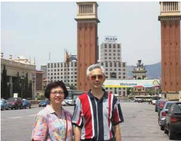
2002 Barcelona, Spain