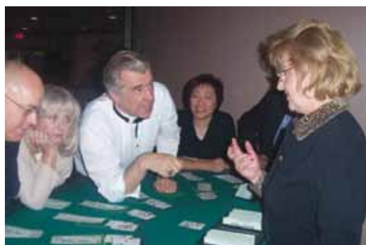
Fun casino after the draw