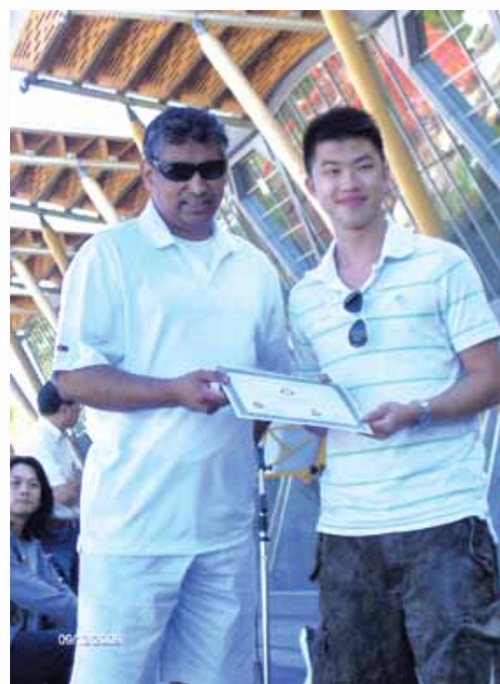
Presenting certificate to Rotaract