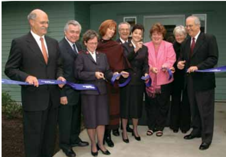
Ribbon Cutting with representatives from Rotary, Salvation Army and Government