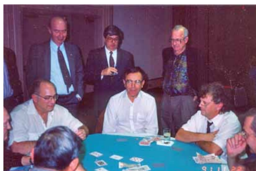
A little poker playing to round out the evening