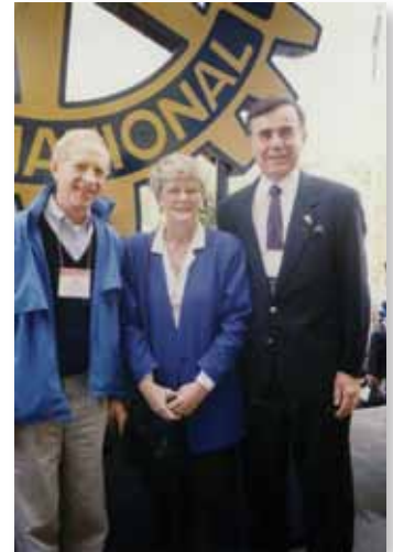
1993 Melbourne, Australia