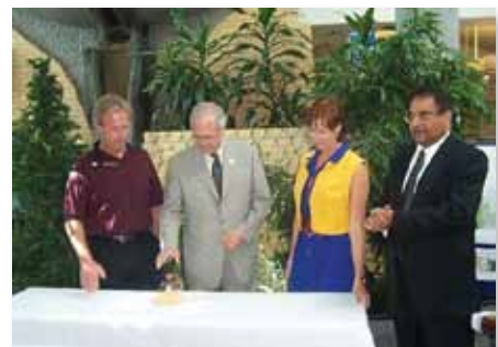
Official launch of "Celebrate with Lights"