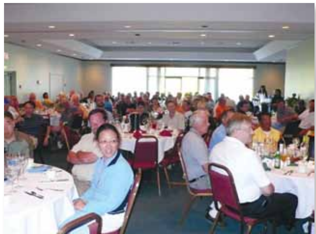
After Tournament Dinner