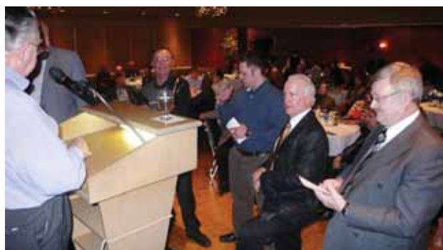
Hopeful winners - last ticket out of the barrel wins the big prize