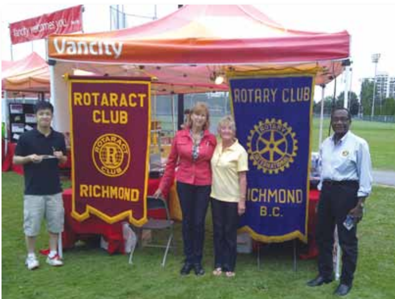
2010 Community Service with Rotaract Club