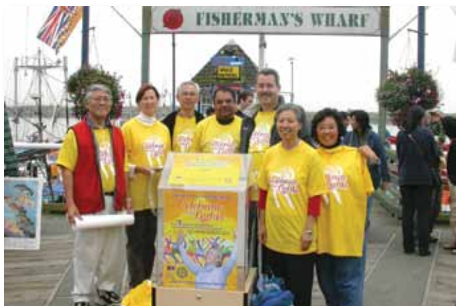
Rotarians at the "Celebrate with Lights" booth in Steveston generating support for the project