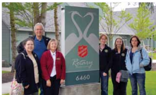
2009 GSE visited Rotary Hospice House