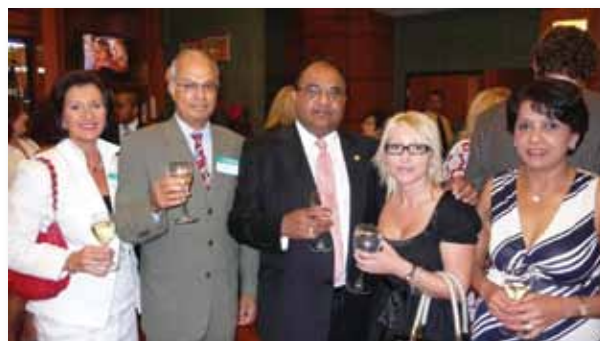
June 28, 2008 Seniors Gala Recognition Luncheon