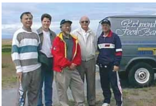
Richmond Food Bank