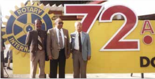
1972 Houston, Texas