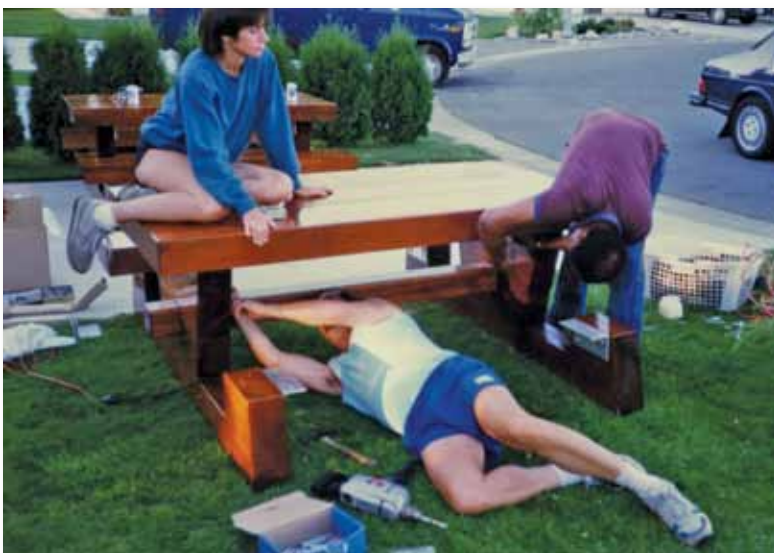
1989 Rotarians work for the community in many ways