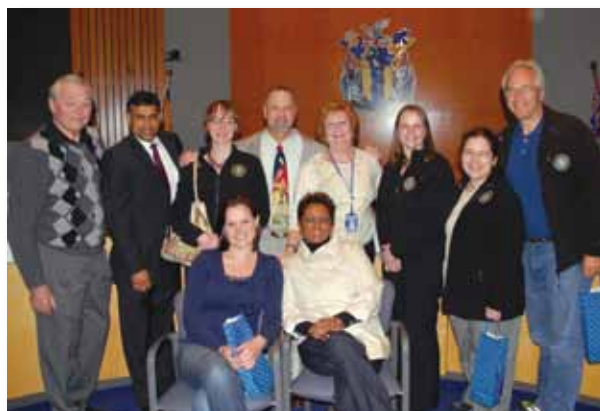
2009 GSE visited Richmond City Hall