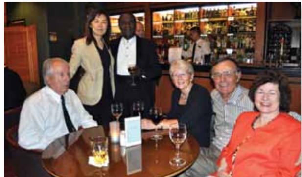
2010 President's Ball cocktail hour