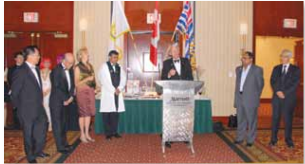
2009 Board of Directors and members