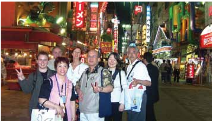
2004 Osaka, Japan

Otto Rieve took a trip around Australia on motorcycle before stopping in Brisbane.