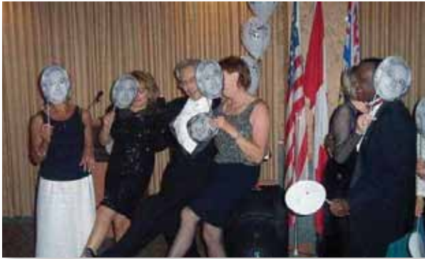
2003 President's Ball