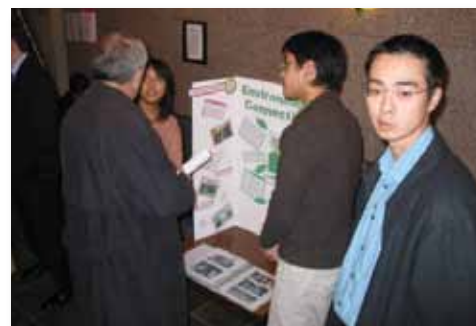
2006 Evening at the Arts: Rotaract Club of Richmond with their Green Olympics display