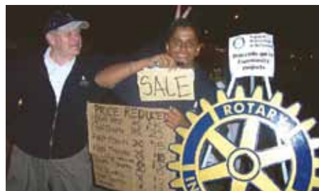
Selling Tall Ship souvenir