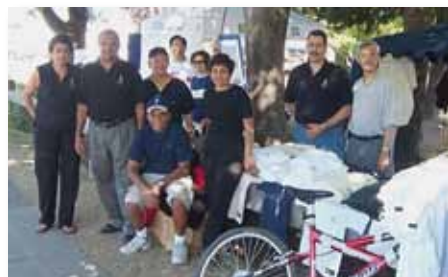
Rotarians and Volunteers in Steveston